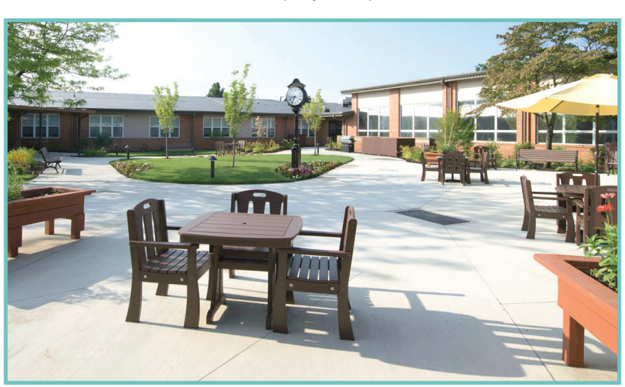
To make a donation, please use the enclosed envelope or visit us online at www.unitedmethodisthomes.org/giving.